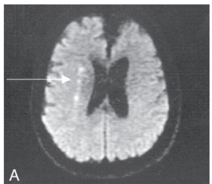
Fig 2. A, Diffusion-weighted MR imaging of patient 2 shows a linear pattern of increased signal intensity in the internal borderzone region of the right hemisphere ( white arrow ). B, Conventional angiography confirms the presence of a heavily calcified bulb with total occlusion of the internal carotid artery at the bifurcation ( solid black arrow ). C, Poststent placement and angioplasty show the antegrade flow across the occluded segment distally ( dashed black arrow ). D, The patient also had an atherosclerotic stenosis evident at the C1 level of the extracranial internal carotid artery that was not revascularized ( black arrowhead ). There is normal filling of the intracranial vessels. E, A xenon CT after preprocedure acetazolamide administration demonstrates poor cerebral vasoreactivity to the right hemisphere. F, A xenon CT after postprocedure acetazolamide administration demonstrates robust augmentation of blood flow to the right hemisphere. G, The color map demonstrates the difference in blood flows between Figures E and F, with red demarcating an increase in flow postprocedure. H, Diffusion-weighted MR imaging after stent placement revealed no additional acute infarcts as a result of the procedure.