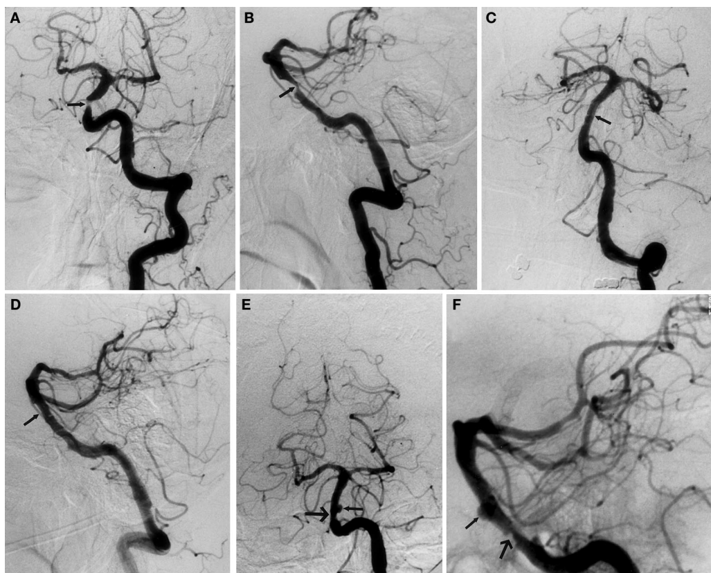
FIGURE 3. Patient 5. A , anteroposterior angiogram, showing basilar artery stenosis (arrow). B , lateral angiogram, showing basilar artery stenosis (arrow). C , anteroposterior angiogram obtained after angioplasty and stenting (arrow). D , lateral angiogram obtained after angioplasty and stenting (arrow). E , anteroposterior, 6-month follow-up angiogram, demonstrating an intrastent aneurysm (small arrow) and new basilar artery stenosis proximal to the stent (large arrow). F , lateral, 6-month follow-up angiogram, demonstrating the intrastent aneurysm (small arrow) and new basilar artery stenosis proximal to the stent (large arrow).

treated in our study experienced either recurrent transient ischemic attacks or strokes while receiving standard antiplatelet/anticoagulation therapy and thus likely warranted further therapeutic intervention after demonstration of the failure of best medical management.